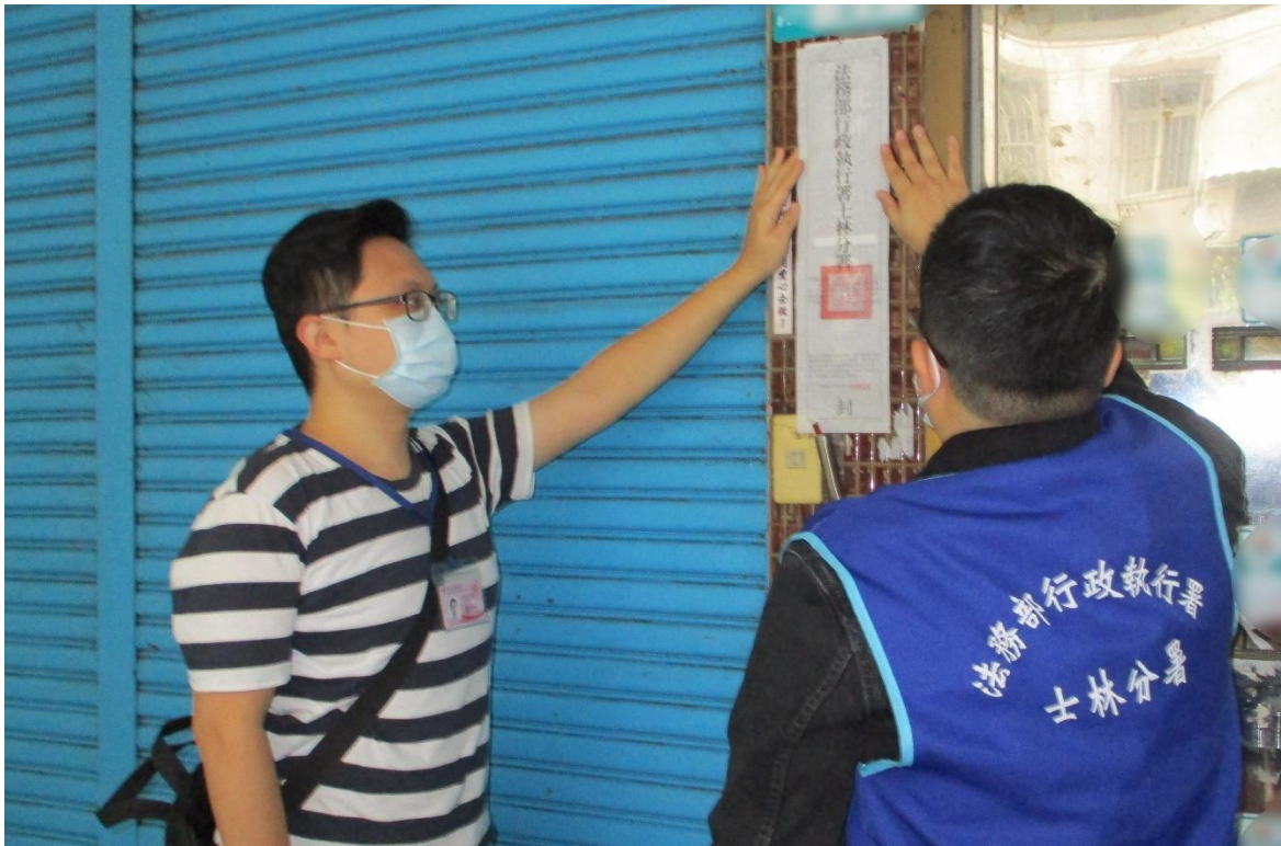
The Shilin Branch seized on-site the real estate of offender driving under the influence.