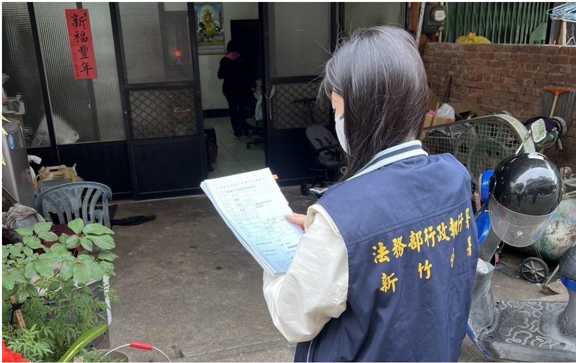
The Hsinchu Branch seized on-site the real estate of offenders driving under the influence. The Taichung Branch sent personnel to deliver the registration documents of real estate of