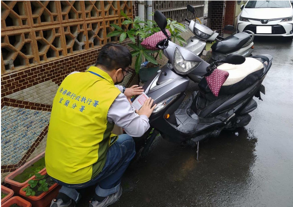
The Yilan Branch seized on-site the motorcycle of the offender driving under the influence.