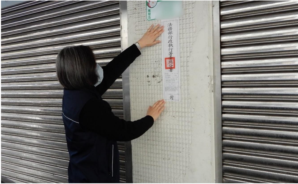
The Taipei Branch seized on-site the real estate of offender driving under the influence.